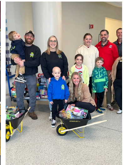
< Blood drive ^ Promedica toy delivery